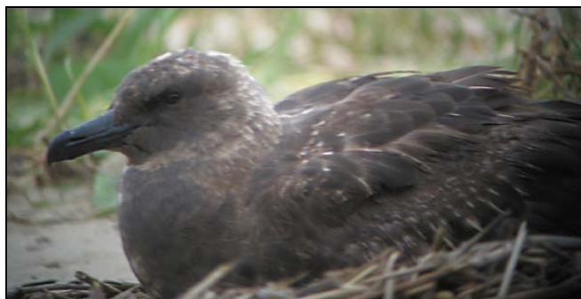
Exhausted Skua at Sea Cliff

birds) occurred in. Several tropicbirds were seen flying up and down the Manhattan section of the Hudson River while several Storm Petrels were found in the south shore bays. The terns were found in some coastal ponds such as Sagg and Hook Ponds on the South Fork.